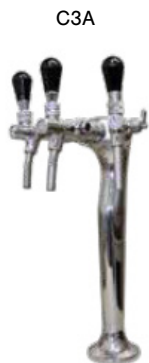
C3A W x D x H (in) 9 x 9 x 20