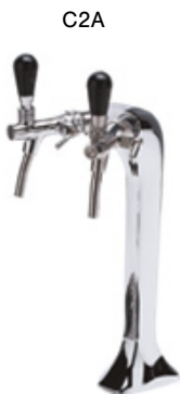
C2A W x D x H (in) 6 x 9 x 19